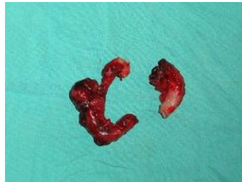
Figure 2: Specimens of the two appendices

Histopathological examination confirmed appendicular micro-architechture in both the