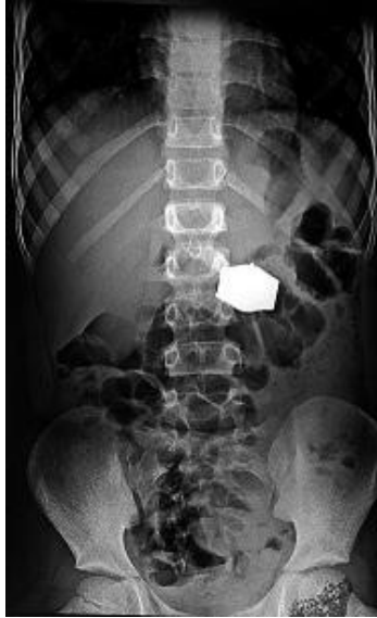
Figure 1: Plain radiograph of abdomen at presentation (after 1 week of ingestion), showing the watch in the upper abdomen

operative period and was discharged after 5 days of the procedure (Figure 2 to 3).