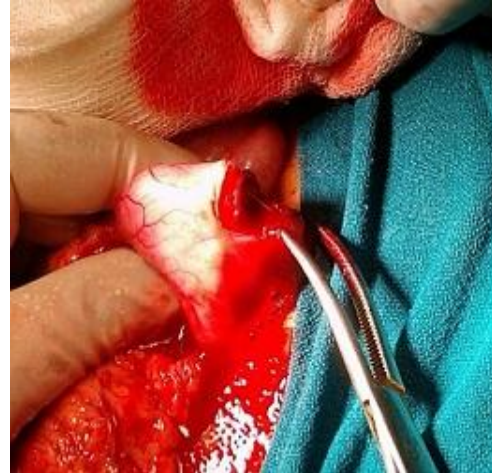
Figure 2: The watch discovered in the gastric antrum on laparotomy

The ingestion of foreign body is one of the most common complications as a result of the oro-exploratory behavior in small children. As noted earlier, the maximum incidence is noted in the 6 month to 6-year age group. The case discussed here reveals the operative intervention performed for a wristwatch, an inch long foreign object, which the child ingested a week earlier, the object, was noted in the upper abdomen and exploratory laparotomy was done. Foreign body ingestion is usually harmless if the ingested foreign body is small or blunt (smaller than 2.5cm is considered harmless) [7, 8], however, for long (>6cm) or sharp, the management protocols call for a more active monitoring. Patients suspected of swallowing sharp-pointed objects must be evaluated to define the location of the object. Many sharp-pointed objects are not radiographically visible, so endoscopy should still follow a radiologic examination with negative findings. Direct laryngoscopy is often used to remove objects lodged at or above the cricopharyngeal