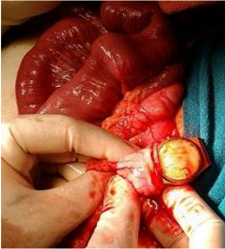
Figure 3: The watch retrieved on Gastrotomy

management of disk battery ingestions and their use may lead to retrograde migration of batteries from the stomach into the esophagus [13].