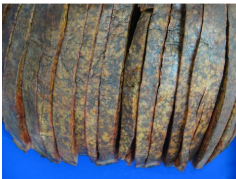
Figure 3: Blue liver. Hepatic surface.

Association between variables was determined using Fisher's test and \chi^2 test. Univariate and multivariate analysis was made using logistic regression model. The variables used were the presence or absence between dilatation any grade, presence or absence of SOS, the use of oxaliplatin based chemotherapy, other chemotherapy used, biological agent, localization, sex and synchronous or metachronous metastasis. Statistical significance was set as two tailed p-value of <0.05.